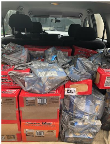
St. Francis Ministry Donations

In following in the steps of St. Francis of compassion, the St. Francis Ministry has been collecting food, monetary donations, shopping, and time to Ending 68 Hours of Hunger.